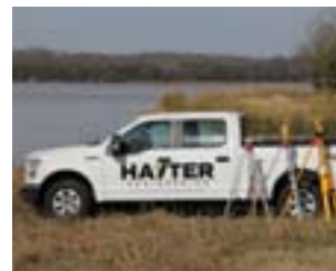
Surveying Services - Design