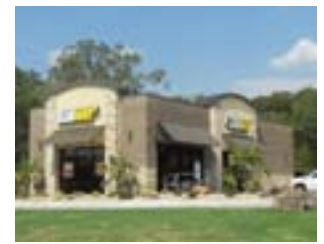
Surveying Services - Commercial / Industrial