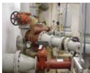
Wastewater Lift Stations