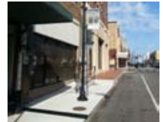
Sidewalks and Lighting