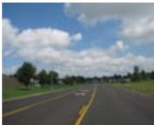
Streets and Roadways