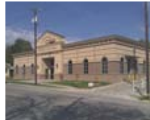
Public / Office Buildings