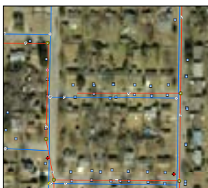
Geographic Information System (GIS)