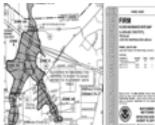
Surveying Services - FEMA