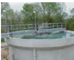
Water Treatment Plants