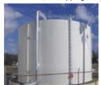
Water Storage Facilities