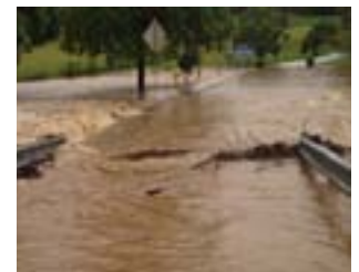
Floodplain Management, Studies, & Mapping