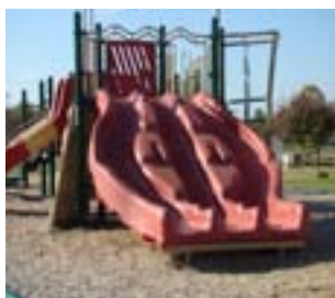
Parks and Recreation