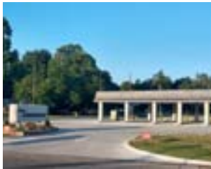
Commercial / Industrial Development

The experience descriptions provided on the following pages are intended to provide the architectural projects that Hayter Engineering has significant experience.