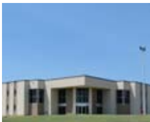
Surveying Services - Educational Facilities