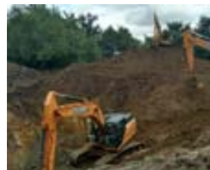
Surveying Services - Construction Layout