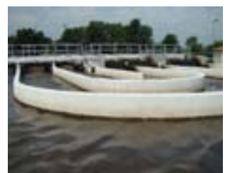
Wastewater Treatment Plants